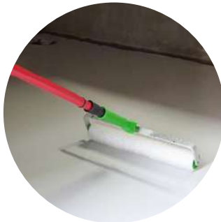
Flooring & coatings