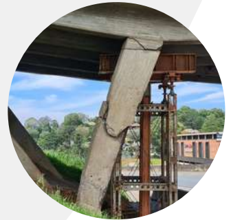
Bridges & bridge jacking