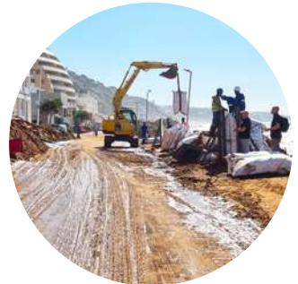
Rapid response & emergency work