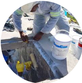
Coatings & anti-corrosion coatings