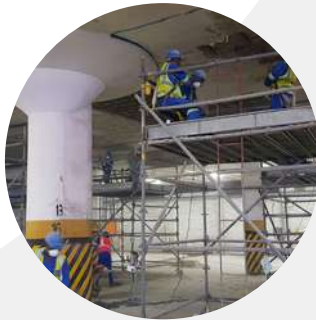
Concrete structural repair